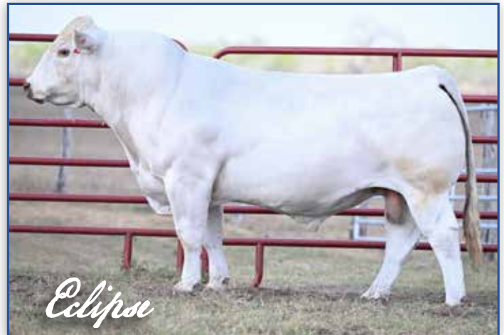
TT MR. THOMAS 153/2 "ECLIPSE"