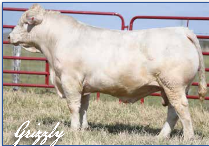
BT MR. THOMAS 212/2 "GRIZZLY"