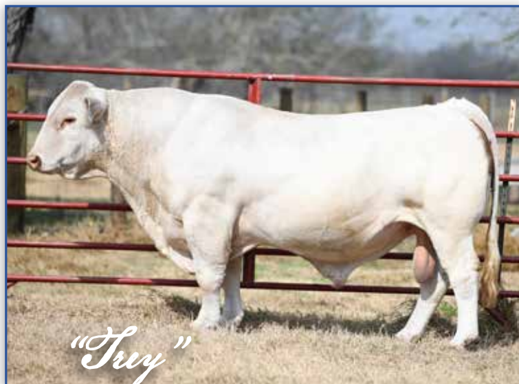
CCC NAISMITH 1015 P ET "TREY"

De-Horned Heifer AICA #F1381496 Sired By MT MR THOMAS 142/1 M976761 DOB: 11/20/25 BW: 80