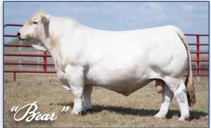
WC LOADED FOR BEAR 2538 P "BEAR"